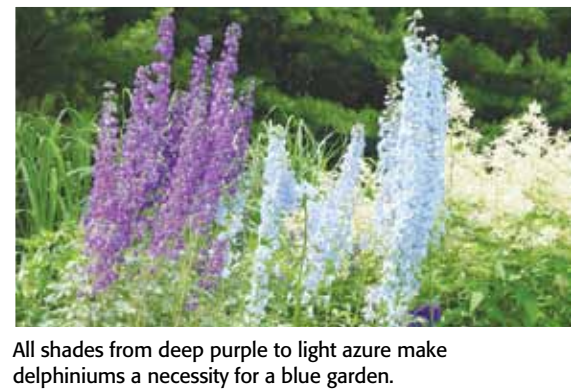
All shades from deep purple to light azure make delphiniums a necessity for a blue garden.

Why do delphiniums seem to die out so quickly after a few years when other perennials keep getting bigger and stronger? There are hundreds of different varieties of delphinium species. As a result of hybridization of the wild species, we are now more commonly familiar with the modern, cultivated, taller varieties of either the Giant Pacific or the Delphinium elatum strains that we see in today's gardens.