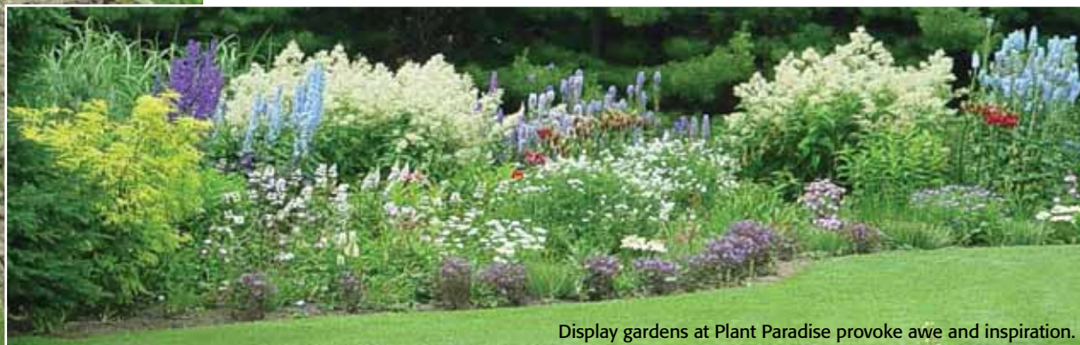
Display gardens at Plant Paradise provoke awe and inspiration.