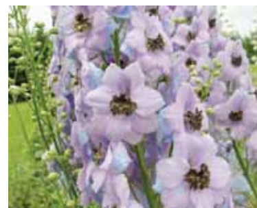
Delphiniums in a range of colours fascinate with their centre "bees."

Unfortunately, the Giant Pacific delphiniums have been the most commonly sold delphiniums at garden centres. These delphiniums were never bred for hardiness or longevity. Savvy gardeners are now learning that the delphinium elatum variety lives up to its nickname, "queen of the perennial garden." This variety has proven its longevity and hardiness. It grows in areas that have a temperature range from minus-35 degrees Celsius in winter to 35 degrees Celsius in summer.